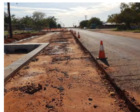
Jundah Roadhouse Culverts

Council resolved to put the project on hold until after the wet season.