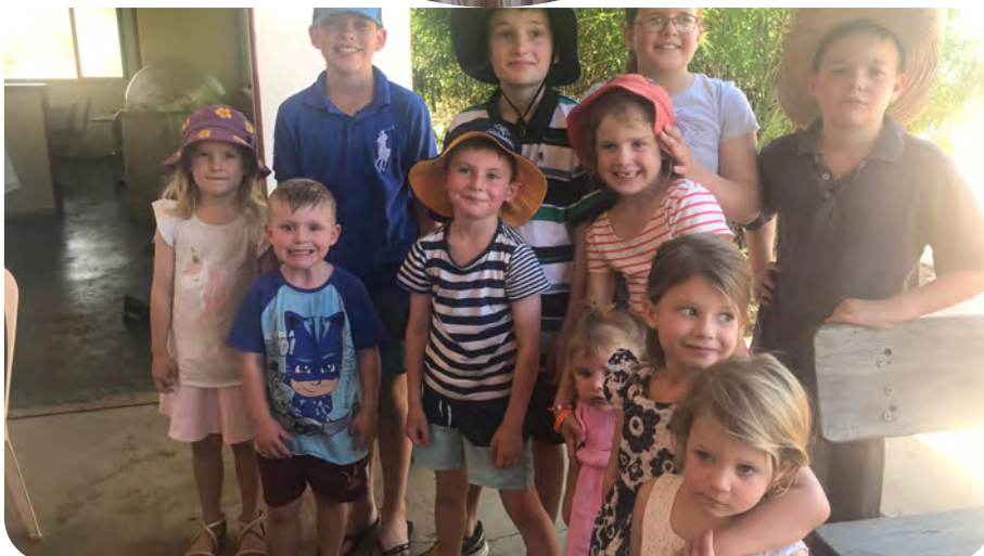
Stonehenge kiddies having a FUN day out.