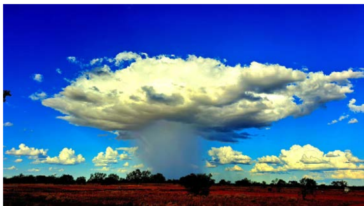
Jundah Storm

Council held a Christmas party in the park in Jundah back in early December for 0-16 year olds. A good crowd of local kids turned up for water activities, Christmas games and a swim in the pool followed by a sausage sizzle and ice blocks. The event was supported by the State Library of Qld.