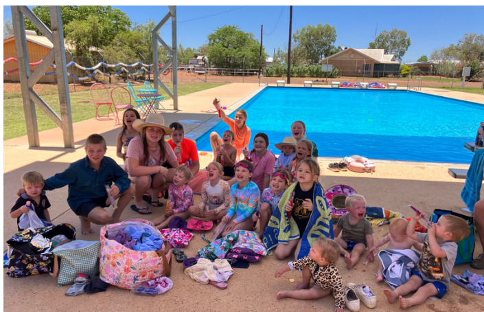
Christmas in the Park