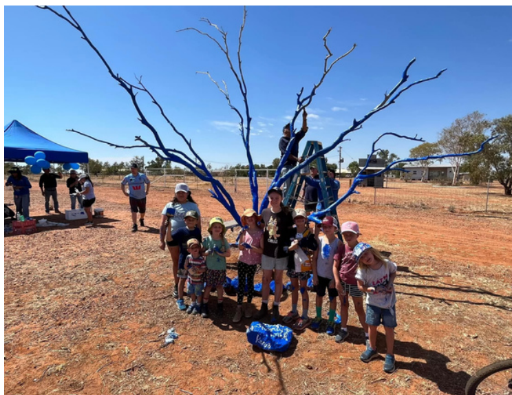
Blue Tree Project

Council recently completed the construction of 3 x 2 bedroom houses in Jundah. The homes were prefabricated in a workshop at Yandina by Oly Homes and transported to Jundah in 2 parts and placed on stumps. The whole process from beginning of construction to completion took about 4 months. Council received funding of $1.5M which delivered the turnkey homes, they are furnished, turfed, fenced, carports, garden sheds and have concrete driveways. They are a very presentable solution for housing in Jundah for singles or couples.