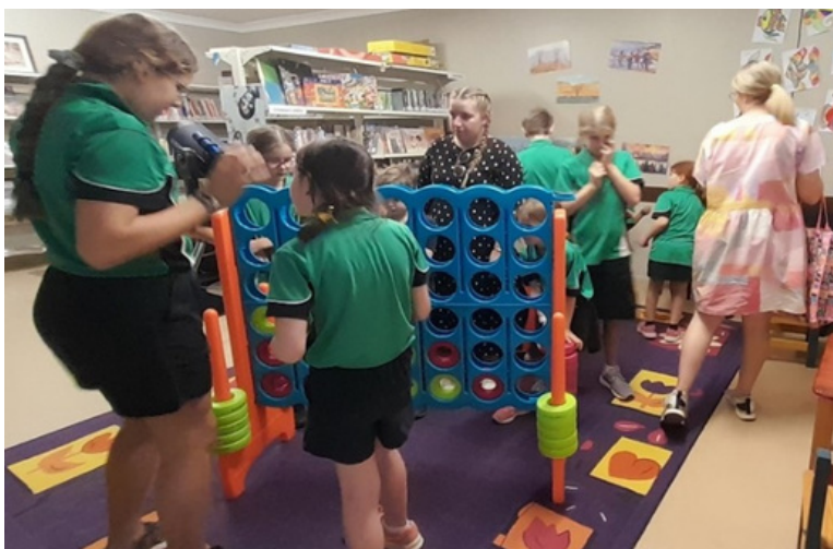
Stonehenge students enjoying the library

INFORMATION CENTRE STATS FOR NOVEMBER JUNDAH 73 - STONEHENGE 183 - WINDORAH 63