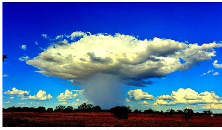
Jundah Storm

Council held a Christmas party in the park in Jundah back in early December for 0-16 year olds. A good crowd of local kids turned up for water activities, Christmas games and a swim in the pool followed by a sausage sizzle and ice blocks. The event was supported by the State Library of Old.