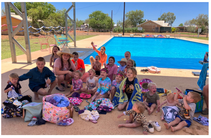
Christmas in the Park