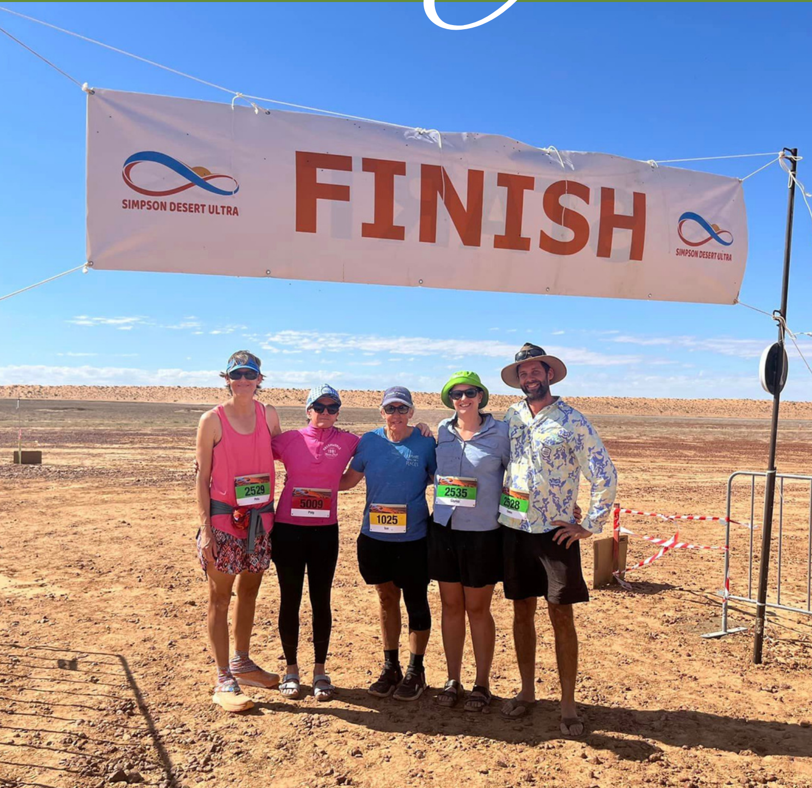
Some Barcoo champions at the Simpson Desert Ultra in Birdsville this month